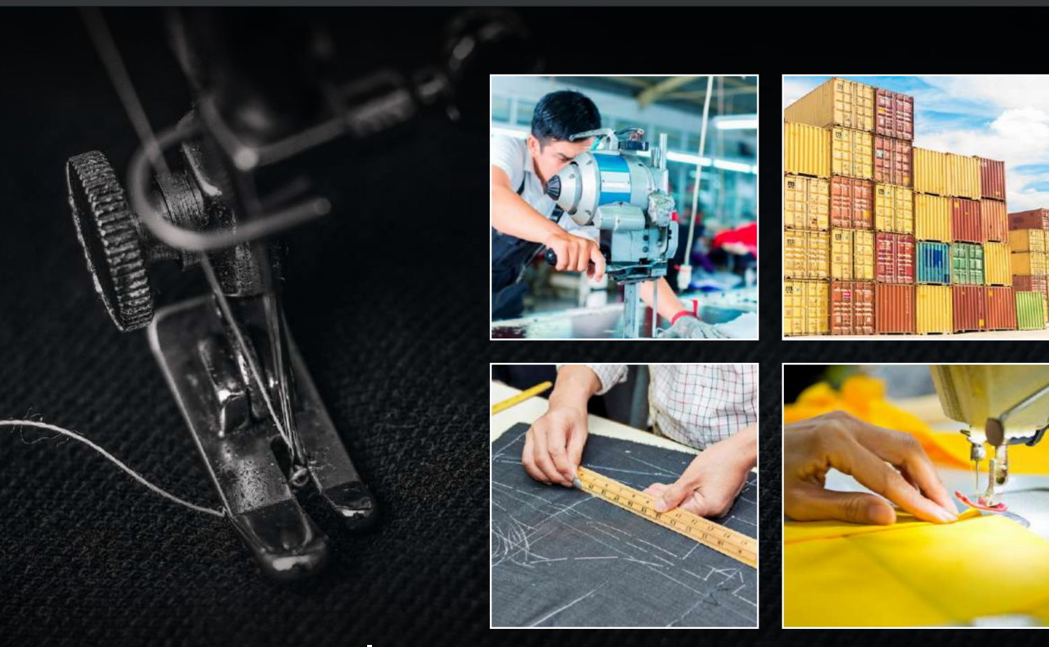
The close relationship with our China factory gives us the ability to guarantee quality apparel, delivered on time.